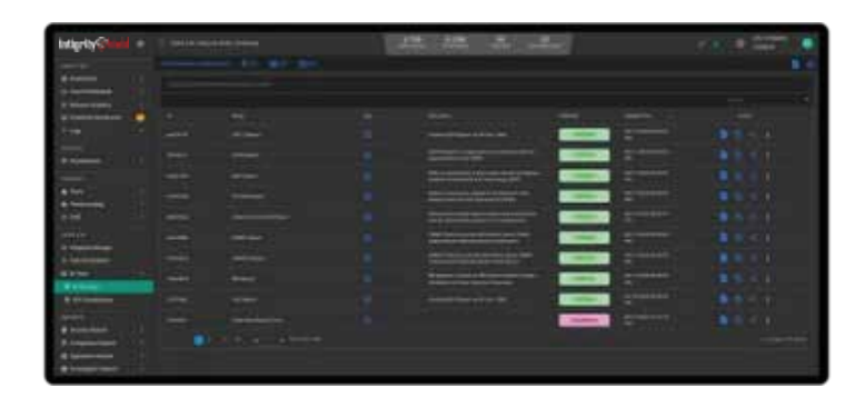
intigrityshield aiSecurity BI360 Report List