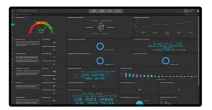
intigrityshield aiSecurity Score360 Dashboard